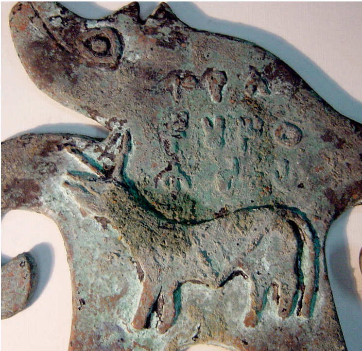
A. Close view of Anthropomorphic figure ( Brahmi script with unicorn)