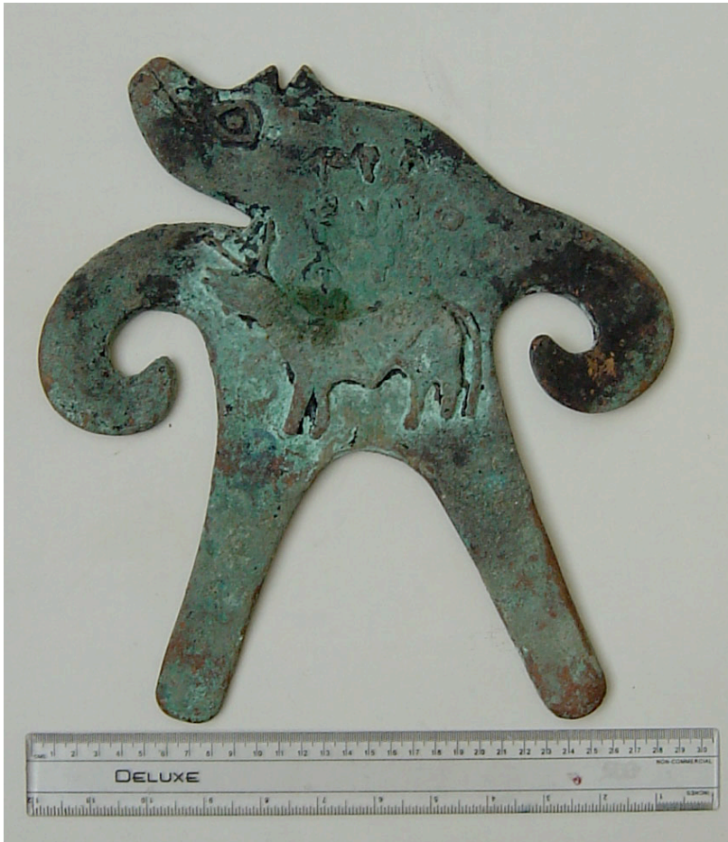
A. Front view of Copper Anthropomorphic figure