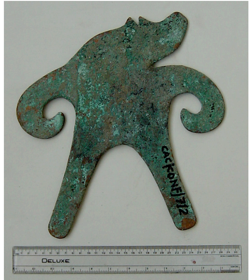
B. Back view of Copper Anthropomorphic figure