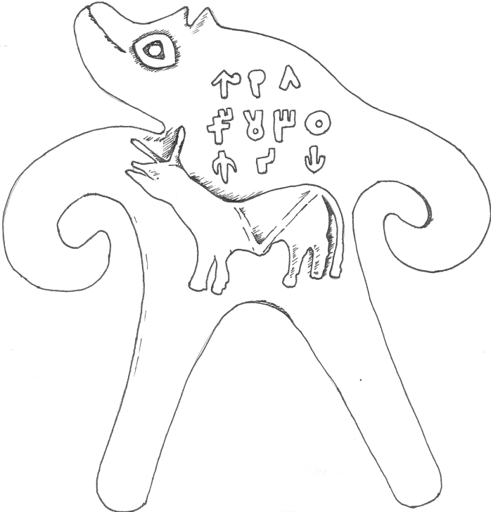
A. Composite Anthropomorphic figure (Boar and human )