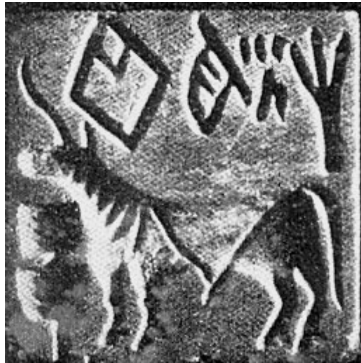
B. Soapstone seal with Indus script and unicorn